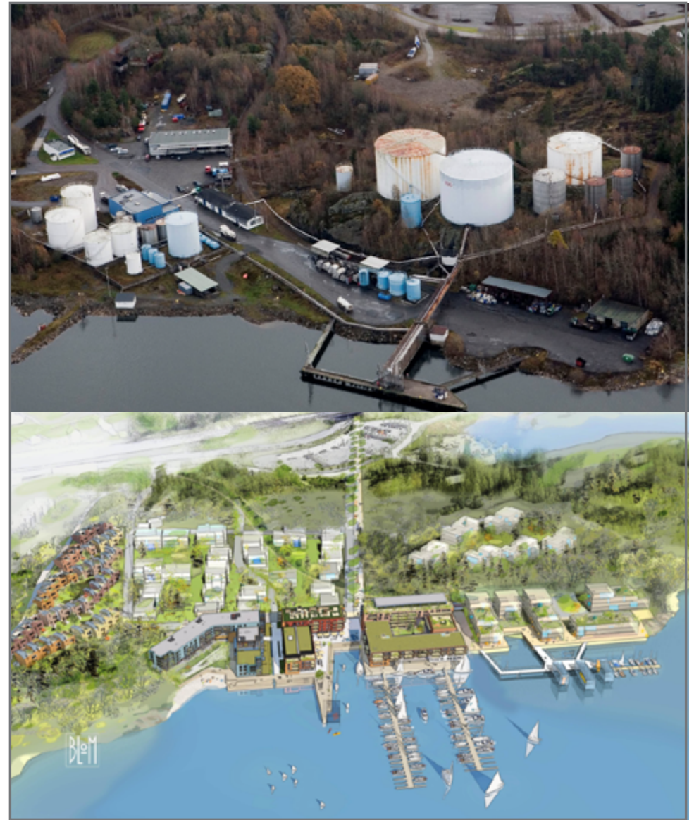
Industrial site rehabilitation: waste oil handling site (top) is transformed into a seaside residential and commercial complex (bottom).

Assessing the near surface is of utmost importance in this type of project. Several challenges were identified: depth to bedrock, settling of buildings, area stability, slope stability, and the presence of quick clay. It was therefore decided to perform a systematic geological analysis of the area in order to establish a representative predictive 3D/4D geological model.